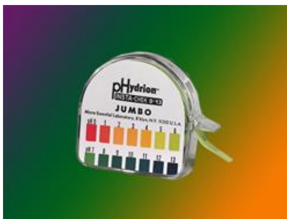
Ph Test Paper Strips

I test my saliva in the morning before I have brushed my teeth or eaten anything.